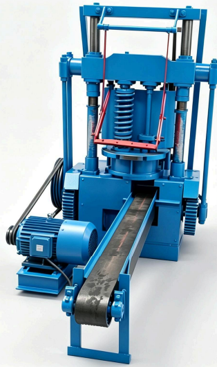
⚙ Precision stamping forming – square, round, hexagonal shapes