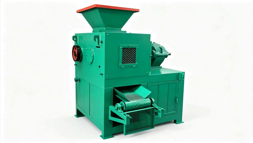
🌱 Complete briquetting line – efficient & stable