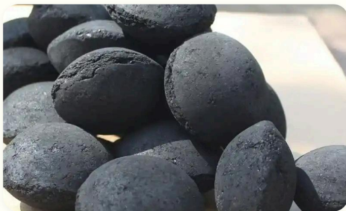
🔥 Industrial Fuel