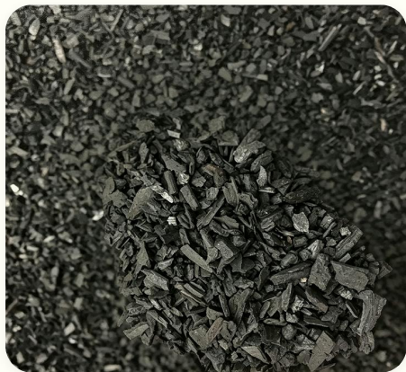
☒ Charcoal powder