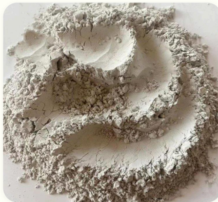
🔥 Coal powder