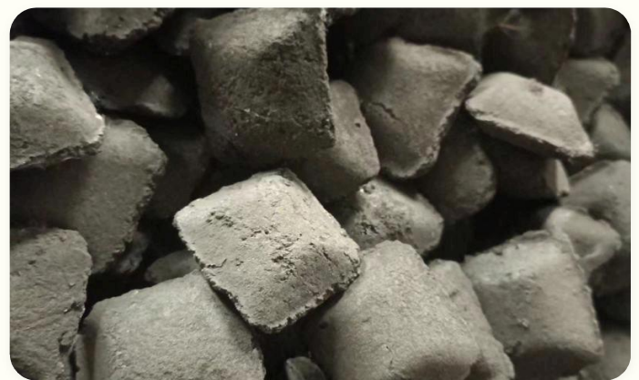
🏭 Metallurgical Molding