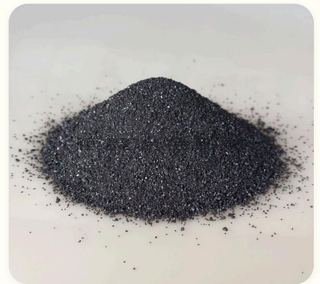
⚠️ Mineral powder