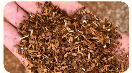
🔹 Mushroom substrate