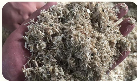
🔹 Biomass pellet raw material