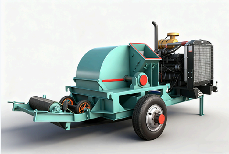
Mobile Disc Wood Crusher · Efficient & Stable Operation