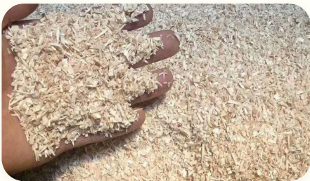
🔹 Wood chips 1~20mm