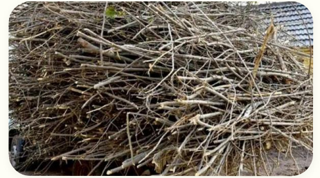
🌾 Straw/Cotton Stalk